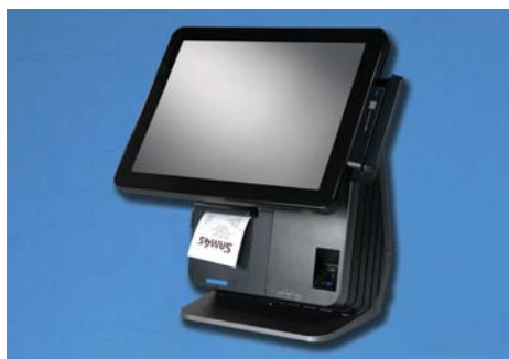
Card Reader / Printer / Fingerprint Reader