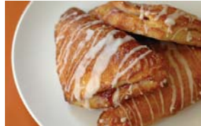
Dusty Environments Like Pizza and Bakeries