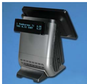
Optional Integrated VFD Customer Display