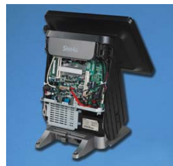
Tool-Free Entry to Access RAM and Hard Disk Drive Simplifies Serviceability