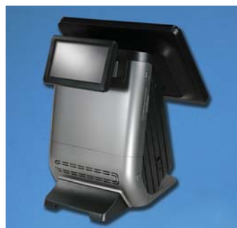
Optional Integrated 7" or 9.7" LCD Customer Display