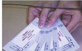
Theater Concessions / Ticket Booths / Box Offices