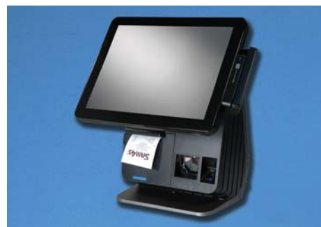
Card Reader / Printer / Scanner + Fingerprint Reader