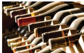
Tobacco Stores / Bars / Liquor Stores