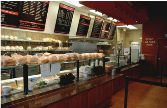
Cafeterias / Quick Service Restaurants