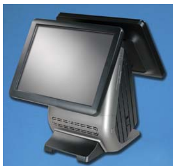
Optional Integrated 15" LCD Customer Display