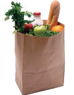
Convenience Stores / Small Grocery Stores