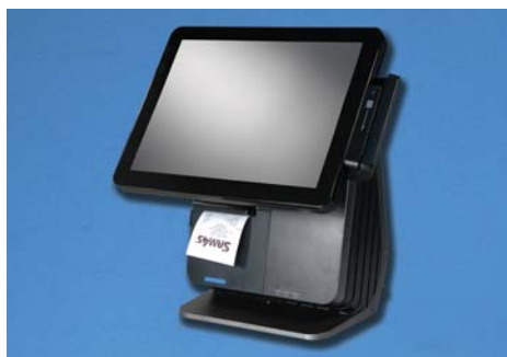
Card Reader / Printer