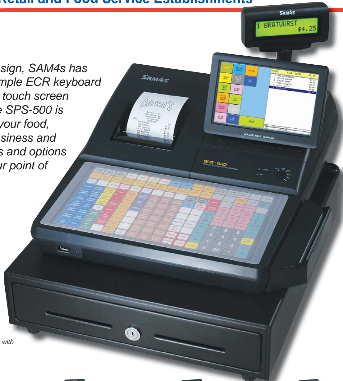
SPS-500 Series Hybrid ECRs Shown with Optional Card Reader

Featuring a hybrid design, SAM4S has combined fast and simple ECR keyboard entry with an intuitive touch screen operator display. The SPS-500 is easily configured for your food, beverage, or retail business and provides the functions and options you need to meet your point of service needs.