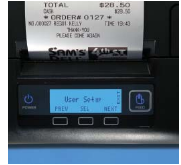
Liquid Crystal Display Guides the Operator Through Setup and Option Selections