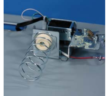
Heavy Duty 2-Stage Latch Mechanism