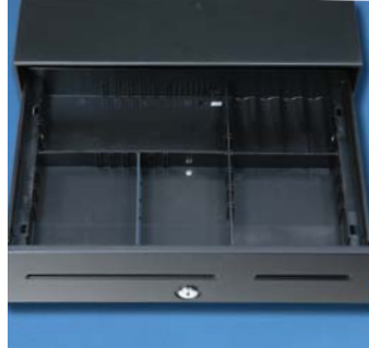
Configure the Storage Area to Your Needs Using the Adjustable Partitions Provided