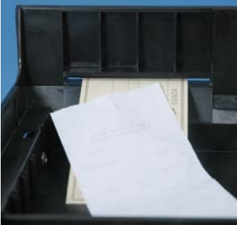
Checks and Card Slips Can be Inserted Into the Media Slots without Opening the Drawer