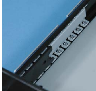
Drawer Glides Effortlessly on Side Rails with 24 Steel Ball Bearings per Rail