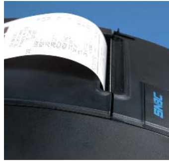
Liquid Guard Built Into the Cabinet Design