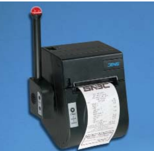
Optional Audio/Visual Print Messenger