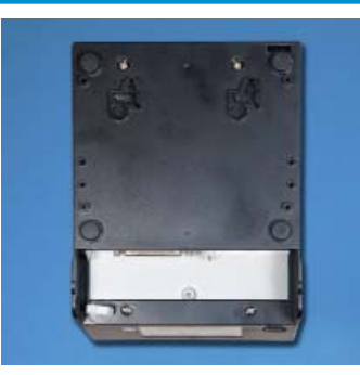
Built-In Wall Mount Capability