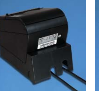
Optional Power Supply Cover with Cable Management Slots