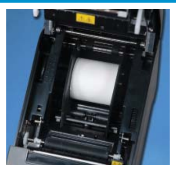
Drop and Print Paper Loading with an Adjustable Paper Width Selector