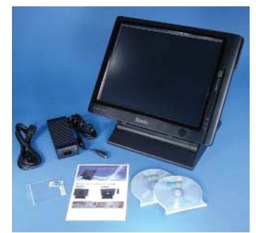
SPT-3000, Power Supply and Cord, Installation Guide, CD with Manual, Utilities and Drivers, Blank Name Plate Cover, CF Card with Software