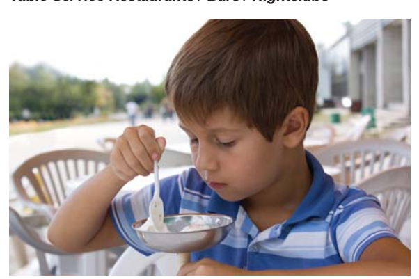
Quick Service Restaurants / Ice Cream Parlors