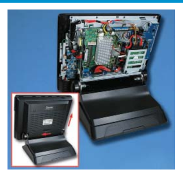
Tool-Free Access Optimizes Serviceability