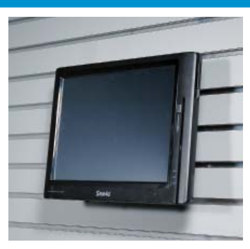
Shown with Optional Wall Mount Bracket