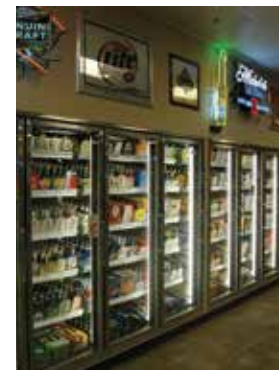
Beer / Liquor Stores / Small Grocery Stores