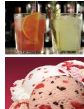
Bars / Ice Cream Parlors / Coffee Shops