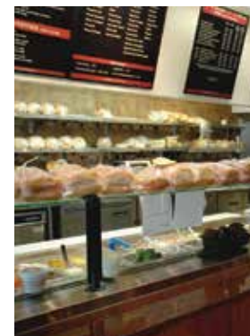
Cafeterias / Table Service / Quick Service