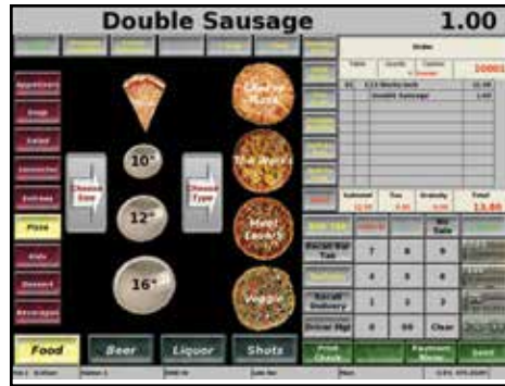
Graphic screens guide operators with minimal training.