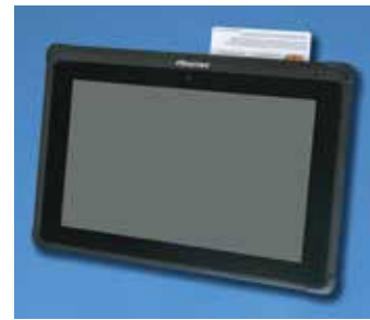
Integrated Card Reader Standard