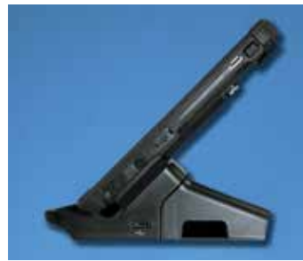
Stylish, Space-Saving Rugged Tablet Includes Docking Station