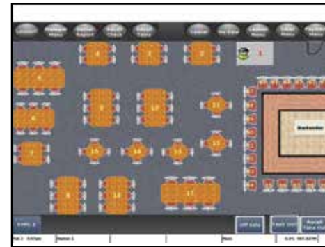
Customized graphical table maps.