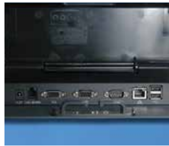
Lift the Rear Panel to Access the Docking Station's Ports