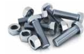
Hardware, Paint or General Retail Stores