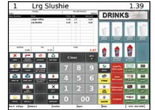
Graphic screens guide operators with minimal training. Condiments, flavors, instructions and options can be placed upon one key. When an item is registered, a specific key displays the options available for the item.