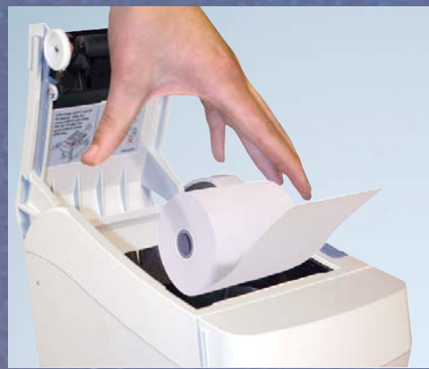
Drop and Print Paper Loading

All product features are subject to change without notice.