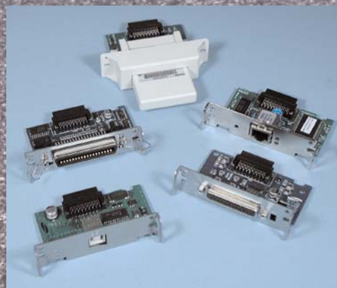
Easy to Change Interface Modules