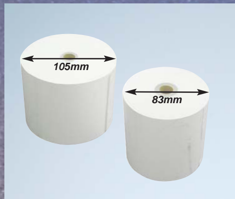
Accommodates Larger Paper Roll