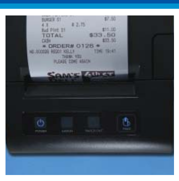
LED Indicators and Feed Button