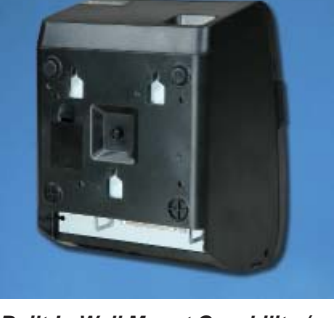
Built-In Wall Mount Capability / Easy Access to Dip-Switches