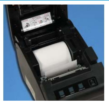
Drop and Print Paper Loading – Optional Paper Width Selector Allows 58mm Wide Paper Rolls