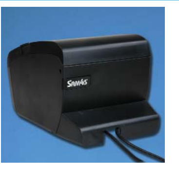
Standard Cable Management Cover

A Serial (Shown) or Parallel B USB C Cash Drawer D DC 24V Power-In