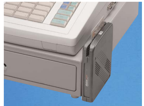
DataTran™ Integrated Credit Option