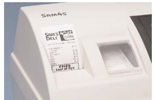
Quick and Easy Drop and Print Paper Loading