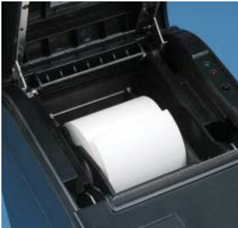
Drop and Print Paper Loading with an Adjustable Paper Width Selector