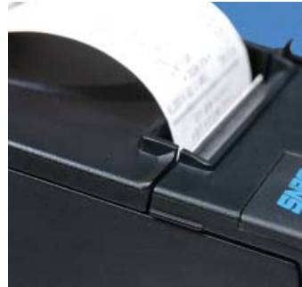
Liquid Guard Built Into the Cabinet Design