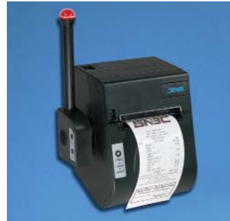
Built-In Wall Mount Capability and Optional Audio/Visual Print Messenger