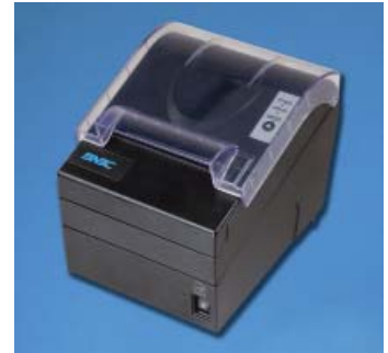
Optional Spill Cover