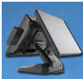
Optional Integrated 15" Rear LCD Customer Display (Reflection POS for Windows)