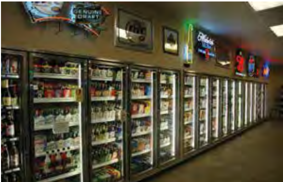
Beer / Liquor Stores