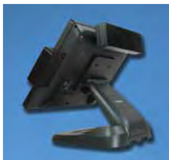
Optional Integrated VFD Customer Display