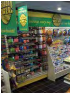
Convenience Stores / Dollar Stores / Gift Shops