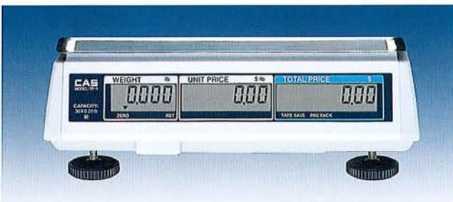
Display On The Rear Side