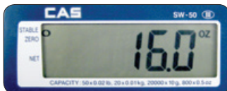
▲ Oz: SW only