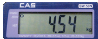
▲ Kg: SW & SW-Z