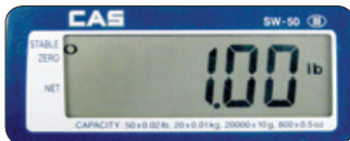
▲ Lb: SW & SW-Z