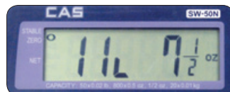
▲ Lb:oz fraction: SW-Z only