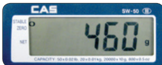
▲ Grams: SW & SW-Z