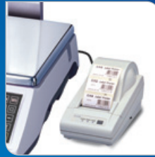
Optional Label Printer