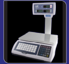
VFD Pole Model