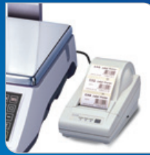
Optional Label Printer