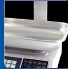
Optional Fish Pan