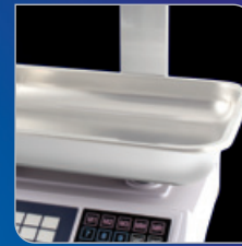
Optional Fish Pan