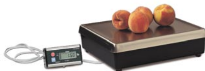
Model 6720 with remote display only